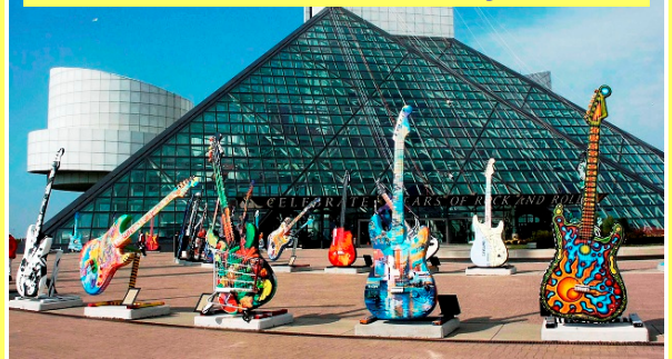
The Rock and Roll Hall of Fame

We have several tour packages planned which will be covered in detail in your June Newsletter. They include The Rock and Roll Hall of Fame which opened in Cleveland on September 2, 1995. Since that time, it has become a prime tourist attraction with nearly 570,000 visitors in 2017 alone. With the induction ceremonies taking place here this year for the enshrinement of the Class of 2018, Bon Jovi, The Cars, The Moody Blues and Nina Simone; the Rock Hall has added new exhibits honoring each of them. Your chance to visit the Hall and neighboring sights should be at the top of your list of tours. Don't miss it!